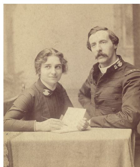
Founders Maud & Ballington Booth