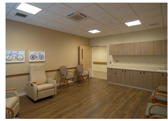
Our four group rooms allow for a variety of daily treatment groups to address the individual needs of each patient.