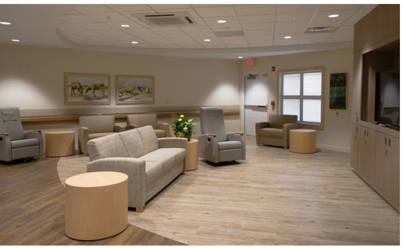
Sojourn at Seneca's spacious and inviting Day Room encourages our patients to engage in prosocial activities when not in therapy.