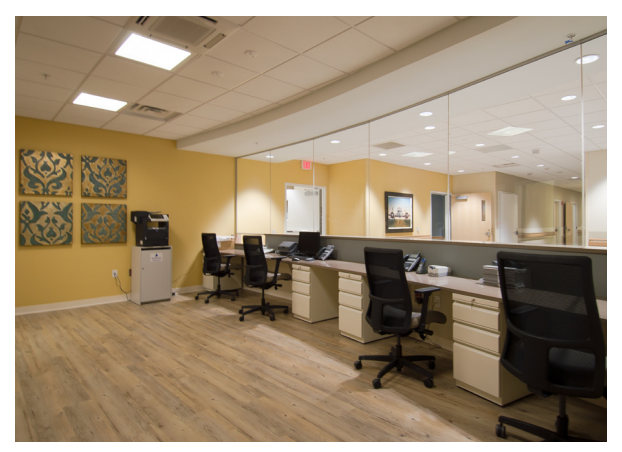
The large nurses station is state-of-the-art equipped and helps to enable our staff of specially trained RNs and Behavioral Health Technicians to provide excellent care to our patients.