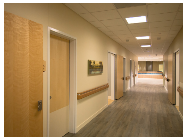
Artwork and natural wood doors add warmth to hallways.