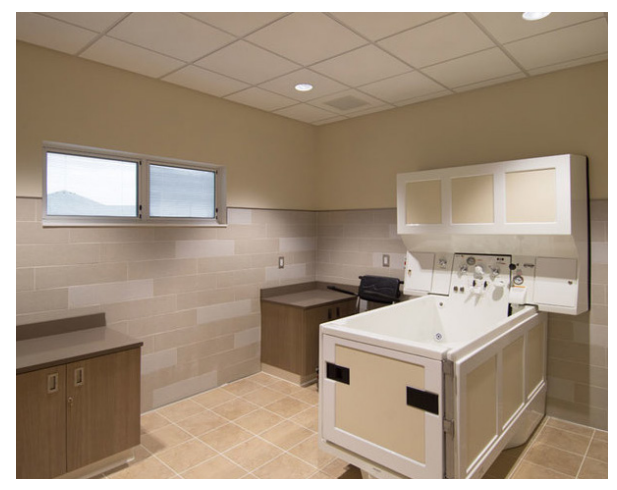
Patient Spa encourages patient relaxation and can help reduce agitation.