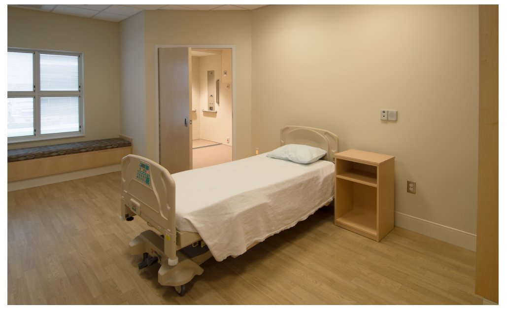
Sojourn at Seneca's 24 all private patient rooms each have a private full bath and area appointed with large windows and window seats that let in the natural light. All of our patient rooms and bathrooms are equipped with numerous safety features that help to protect our patients while maintaining patient dignity and privacy.