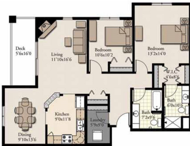
The Riverview 2BR/2BA 1,230-1,278 SQ. FT.