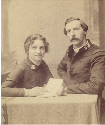
Founders Maud & Ballington Booth