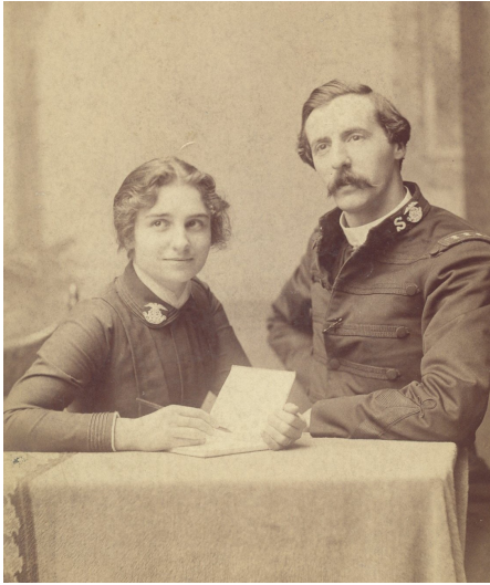
Founders Maud & Ballington Booth